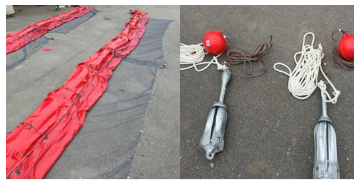
Figure 2. Litter booms with net curtains and grapnel anchors used to moor the litter boom.